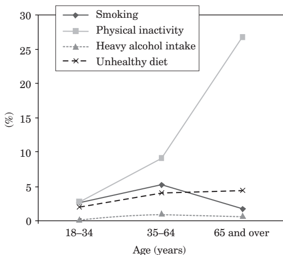
Fig. 1. Percentage of cases with solitary behavioral risk factors and excess abdominal fat.

The estimation of proportion of combinations of two, three or four BEHF are less than 0.5% in the CAHS population.