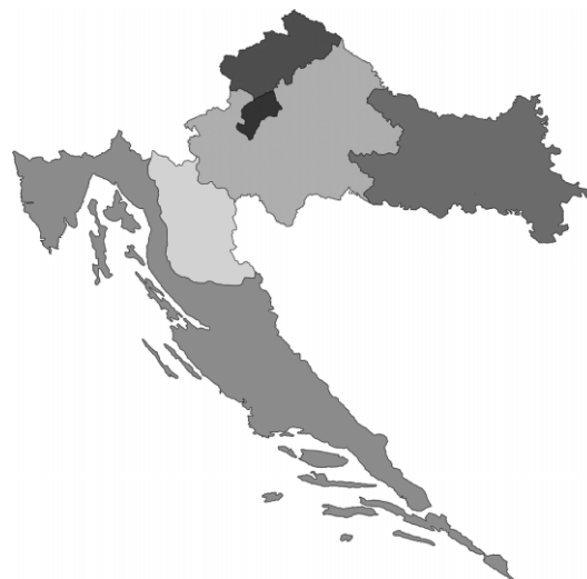
Fig. 1: Regional distribution of physical inactivity in men, based on the Croatian Adult Health Survey 2003 data; grey color denotes the gradient of physical inactivity, from the least inactive (lightest grey) to the most inactive region (darkest grey).

Our study showed that the level of physical inactivity varied among regions of Croatia, with similar trends for both men and women. Overall, women tended to be less physically active than men in all regions except in Northern and Eastern Croatia. The lowest proportion of physically inactive people lived in Mountainous region (14.12% of men and 27.38% of women). In contrast, the City of Zagreb was the region that had the highest proportion of physically inactive inhabitants, with striking figures of almost 40 % of men and over 43 % of women. Results