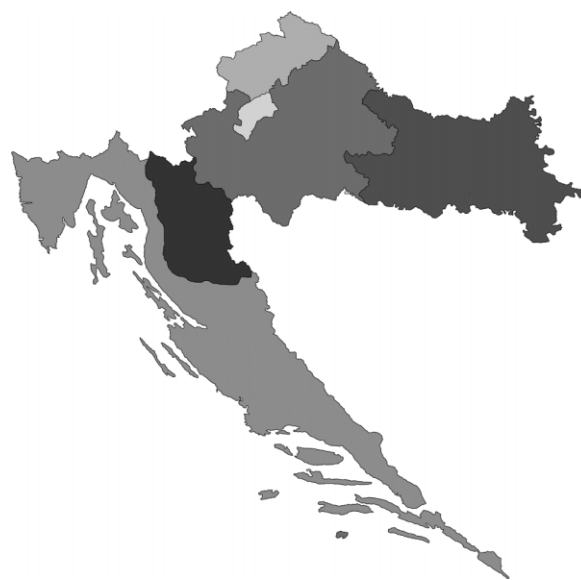
Fig. 2. Prevalence of non-controlled arterial hypertension in 18+ years old women by regions of Croatia.