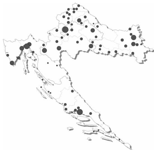
Fig 2. Sampling frame for the CAHS, with circle size being proportional to the sample size for each town.

from different surveys across Europe 1 . The use of the complex sampling frame and the weighting method requires that all the analyses be performed with bootstrap variance estimation, in order for the results to be representative for either the six defined regions or entire Croatia 14,19 . The use of the weighting also requires special variance estimation methods, which is obtained by the coefficient of variation (CV). Values of CV between 0 and 16.5 are considered to be acceptable, between 16.6 and 33.3 marginal, while those over 33.3 are considered unacceptable 14 .