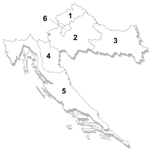
Fig. 3. Geographic representation of the re-organized regions that were used to define the CAHS sample: 1 – Northern Croatia, 2 – Central Croatia, 3 – Eastern Croatia, 4 – Mountainous Croatia, 5 – Coastal Croatia and 6 – The City of Zagreb.

Undertaking of the project of this magnitude requires substantial financial and organizational effort. This is the reason why neither this nor majority of other surveys are being carried out on an annual basis 1 . However, pe-