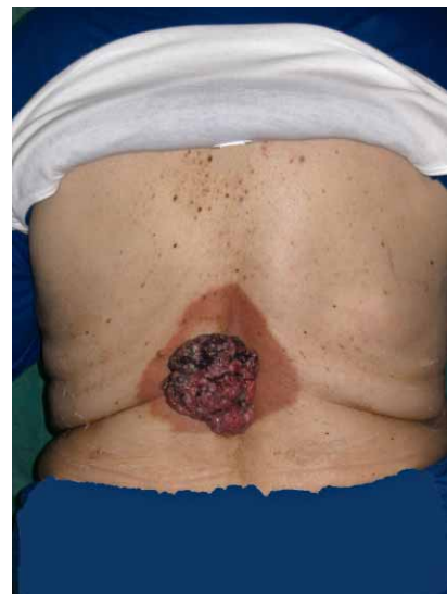
Fig. 1. Exophytic tumor size 8,5 × 8 × 6 cm.

asymptomatic. From time to time she felt itching and little discomfort. She was certain that the lesion was very small, size 0.5 cm.