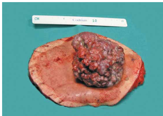
Fig. 3. Excision of the skin with the tumor on top, size 15,5 × 15 × 2 cm.

Pathohistological findings revealed regular epidermis on the surface of the excised erythematous skin that was surrounding the tumor. Tumor consists of nests of atypical epithelial basaloid cells with peripherally palisading cells. Stroma surrounds nests of tumor cells and in some nests keratinization is presented. Infiltration of skin was 1.5 cm and the surgical margins were negative. Tumor was completely removed (Figure 4).