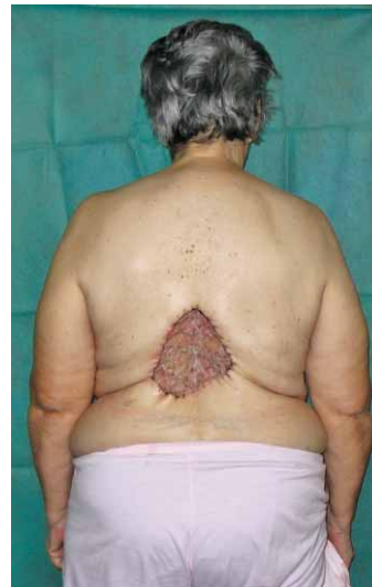
Fig. 5. On the defect of the skin Thiersch' graft was transplanted.

Excised skin defect was covered with split thickens skin graft from the right upper thigh (Figure 5). Three months after the surgery, wound is healing properly.