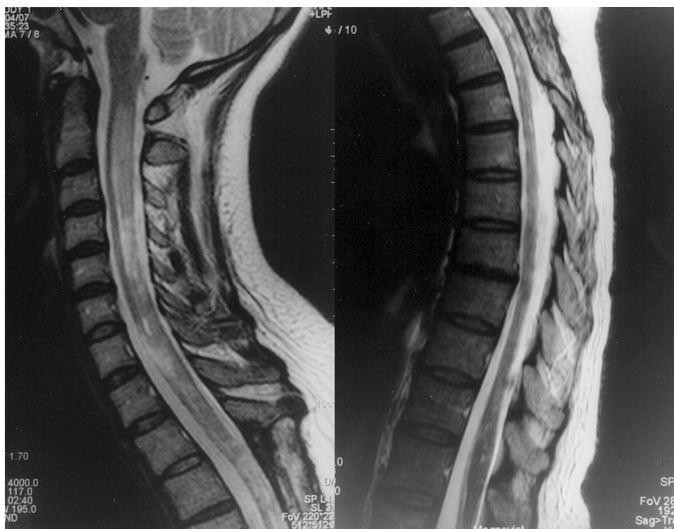
Figure 1 Spinal cord MRI (T2W images) performed in April 2007. MRI shows extensive T2 hyperintense changes along the spinal cord from C2 level till conus. Those changes were most prominent in the cervical and cervicothoracic spinal cord, with widening of central canal in some places and edematous enlargements, as well as with zones of necrosis.

cyclophosphamide (1 g/m 2 ) in a combination with methylprednisolone (1000 mg), once a month during six months. Partial remission of disease activity has been achieved. At the moment patient can use both her arms and can stand supported by sticks. Her recent MRI of the spinal cord revealed gradual decrease of cord swelling and T2 signal hyperintensity. In the meantime, following steroid therapy, she developed diabetes mellitus and osteoporosis, that are being treated successfully.