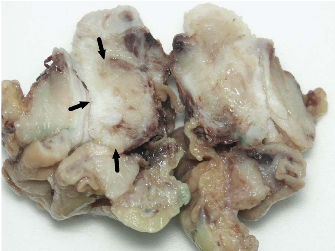
Fig. 1 The resected esophageal specimen contained polypoid, whitishgray tumor (arrows), which measured 3 cm in largest diameter covered by thickened mucosa.