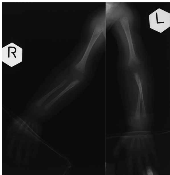
Fig. 1. Roentgenograms of the arms at the age of five months show osteopenic bones with thinned cortices and irregular metaphyses. Ossification nuclei of carpal bones are undeveloped.

Therapeutic efforts were aimed at normalizing blood calcium and slowing down bone demineralization. A low calcium diet decreased serum calcium and normocalcemia was established with calcitonine and chlorothiazide therapy which was previously described to be successful 7 . Subsequent radiographs showed some improvement in bone mineralization but this could not be more thoroughly evaluated because the child died at the age of eight months due to extensive bilateral pneumonia and respiratory failure while waiting for bone marrow transplantation.