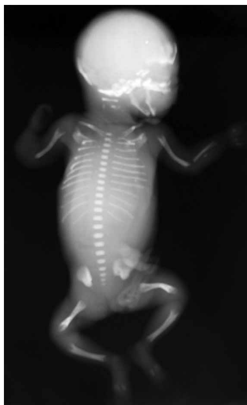
Fig. 2. Roentgenogram of the fetus with perinatal hypophosphatasia shows findings typical for hypophosphatasia. The overall shape is much more preserved than the ossification. The upper limbs show defective ossification of the left ulna and right radius and ulna. The spine shows skipped ossification of the cervical vertebrae and no ossification on the pedicles. The femurs are slightly bowed, while the tibiae are straight and of normal length. The femurs, tibiae and humeri show V-shaped metaphyseal defects very typical of hypophosphatasia.