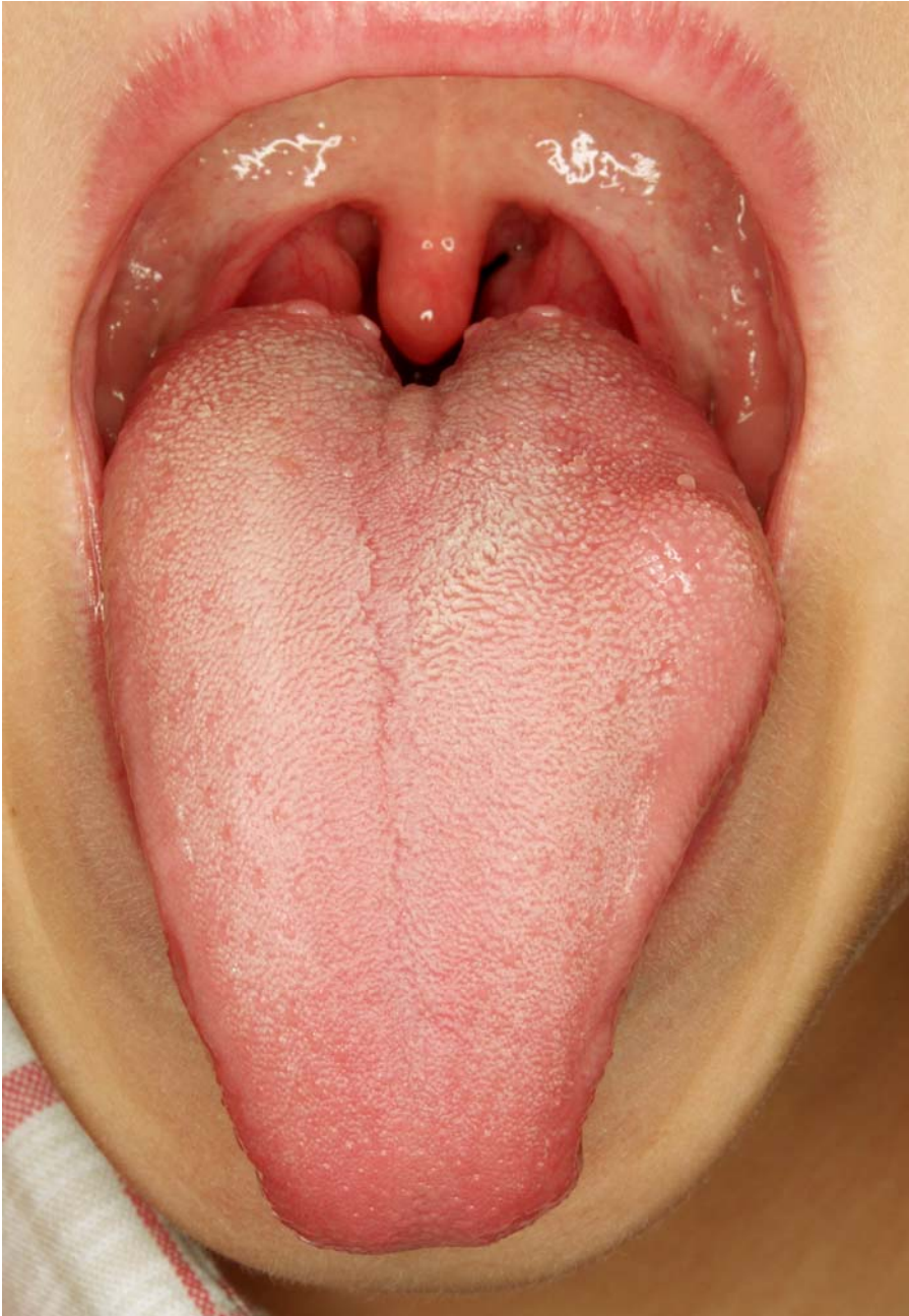
FIGURE (1) The patient at initial examination showing a well-demarcated, submucosal swelling on the left lateral border of the tongue, 15 mm in diameter.