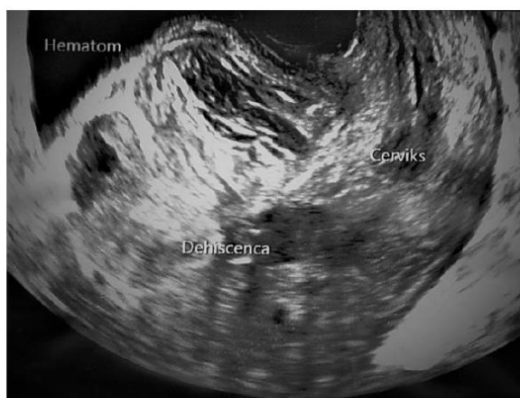
► Fig. 1 Ultrasound pictures of hysterorrhaphy dehiscence.

In light of the worsening of the general and clinical condition during observation, conservative antibiotic treatment was not possible, and exploratory laparotomy and revision were indicated. Preservation of the uterus was decided by resolving the causes that led to the consequent condition (evacuation of the hematoma,