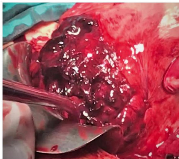
► Fig. 2 Intraoperative findings of the hematoma and hysterorrhaphy dehiscence.