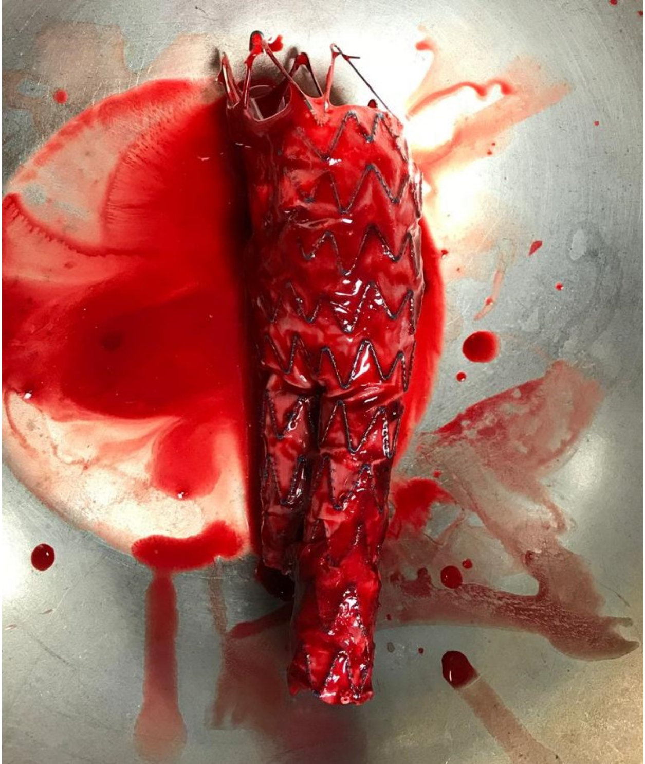
Figure 5. Infected aortic stent-graft after extraction (Source: Archives of the Division of Vascular Surgery, Department of Surgery, University Hospital Center Zagreb – “Rebro”, Croatia).