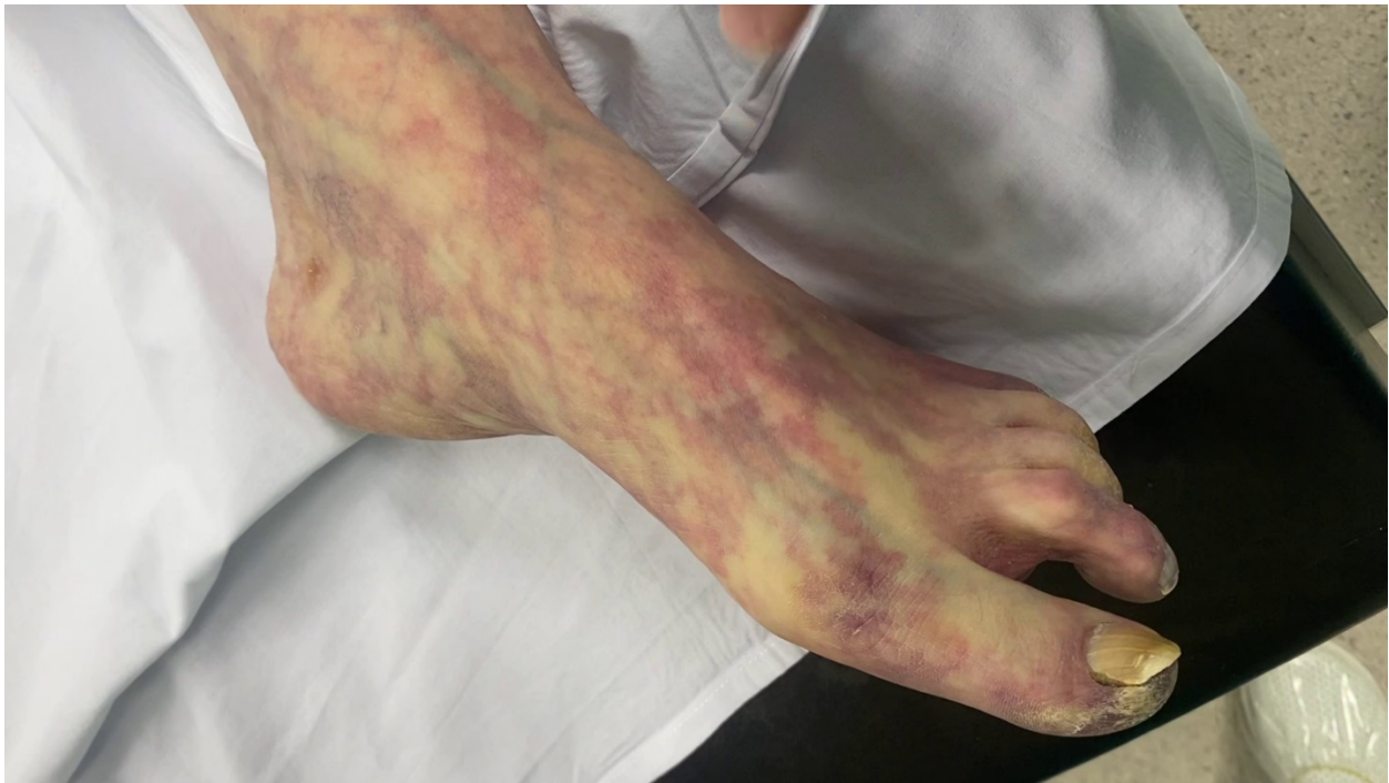
Figure 1. Acute limb ischemia, manifested by pallor and mottled skin appearance (Source: Archives of the Division of Vascular Surgery, Department of Surgery, University Hospital Center Zagreb – "Rebro", Croatia).

Patients who undergo open surgery for aneurysm repair face a higher risk of sudden lower limb ischemia. It's crucial to assess blood flow to the lower extremities both before waking up from anesthesia and before leaving the operating room. If there's a loss of pulses or other signs of limb ischemia right after surgery, it could indicate technical problems with the anastomotic complications, damage as a result of clamping, sudden blood clot formation, or the presence of an acute embolism, all of which need immediate attention. Careful surgical technique is vital, especially when suturing the connections to diseased blood vessels, and caution is necessary when placing clamps to avoid dislodging cholesterol deposits or harming blood vessels. Also, maintaining adequate systemic blood thinning to prevent clots is essential and can be monitored using activated clotting time (ACT) tests, with the heparin doses adjusted accordingly (1,15,16).