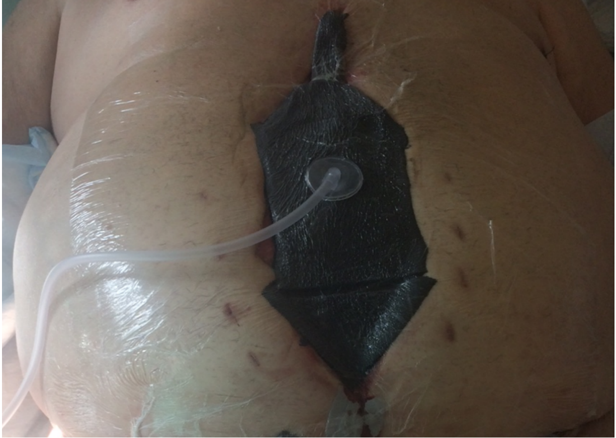
Figure 3. Negative pressure wound therapy in the treatment of abdominal wall defect after decompression due to abdominal compartment syndrome after emergent AAA repair (Source: Archives of the Division of Vascular Surgery, Department of Surgery, University Hospital Center Zagreb – “Rebro”, Croatia).