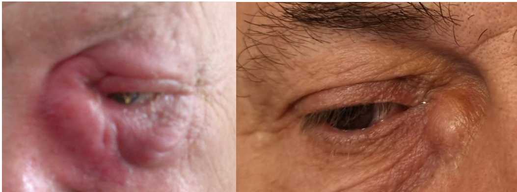
Picture 2. Acute dacryocystitis (left) and Chronic dacryocystitis (right) in elderly patient, courtesy of Asst. Prof. Jelena Juri Mandić.

when extensive block where the probe cannot pass beyond the sac. Although it is only a possible third line of choice, external DCR provide 90 -93 per cent rate of success when dealing with the first indication, unresolved CNLDO after probing or intubation (30). The second indication worth mentioning is, punctal agenesis with canalicular atresia. Children with punctal agenesis are often asymptomatic, and epiphora is developed when there is coexistent CNLDO. Usually, simple agenesis detected by visible papilla and membrane overlying the edge. When punctal agenesis with canalicular atresia is suspected, it can be shown as no visible papilla or membrane. If there is severe NLDO, DCR with retrograde intubation may be indicate (31). As for adults, indications for DCR surgery includes three main indications: The first and commonest one is primary acquired nasolacrimal duct obstruction (PANDO) (Picture 2.) (32).