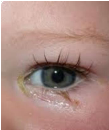
Picture 1. Unresolved CNLDO after probing, courtesy of Asst. Prof. Jelena Juri Mandić.

most common cause of childhood epiphora, other causes include the congenital atresia, craniofacial disorders and other pathologies (26). Indications of dacryocystorhinostomy in children includes four main indications: Unresolved CNLDO after probing or intubation (Picture 1.), punctual agenesis with canalicular atresia; canalicular atresia and acquired canalicular disease.