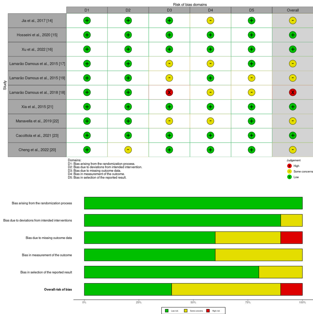
Figure 2. Summary of risk of bias in primary studies [14–23].

trial that are relevant to the risk of bias. Response options for the signaling questions are: (1) Yes; (2) Probably yes; (3) Probably no; (4) No; (5) No information. A proposed judgment about the risk of bias arising from each domain was generated by an algorithm and based on answers to the signaling questions. RoB 2 is conceived hierarchically, and responses to signaling questions provide the basis for domain-level judgments about the risk of bias. In turn, these domain-level judgments provide the basis for an overall risk-of-bias judgment for the specific trial result being assessed. Judgment can be ‘Low’ or ‘High’ risk of bias, or it can express ‘Some concerns’. A summary of this assessment is provided in Figure 2. In terms of the overall risk of bias, one study is assessed as high risk [18], while there are some concerns about the overall risk of bias in the other five studies mainly arising from the risk of bias in the measurement of the outcome and bias due to missing outcome data [14,17,19,20,22].