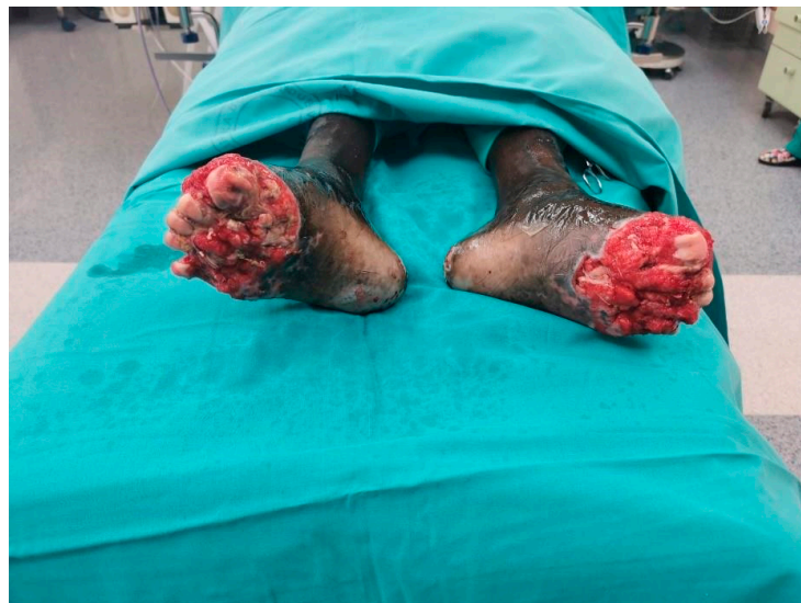
Figure 2. Patient's feet after five days of negative pressure therapy.