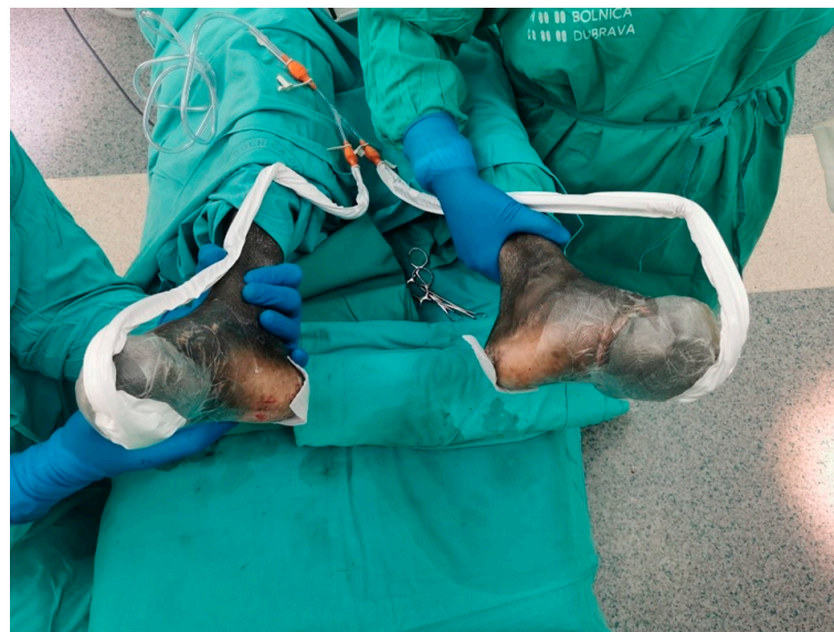
Figure 3. Administration of the NPWT.