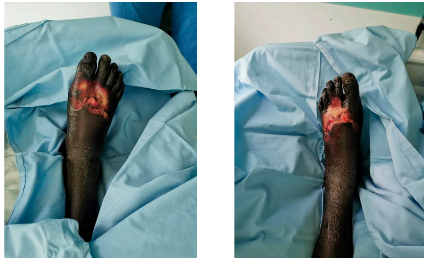
Figure 1. The patient's feet during admission.

dressing and care of the flaps. Physical therapy was started on the third postoperative day. Verticalization with walking exercises was allowed on the seventh post-op day. Thirty days after the last operation, the patient was discharged from the hospital. The hospital stay was prolonged because the patient had refugee status. He could not be discharged from the hospital to be managed in an outpatient clinic until all immigration papers were authorized. On discharge, he was able to walk with one crutch and rest with elevated feet. Carbamazepine was prescribed due to phantom pain syndrome, as well as acetylsalicylic acid ( 2 \times 100 mg during one month) to prevent vascular thrombosis. For the next three months, he had regular checkups on an outpatient basis. Wound care consisted of dressings every 3–4 days in a refugee facility care and every 2 weeks as outpatient dressing in our outpatient clinics. Both feet and donor regions healed uneventfully (Figure 4).