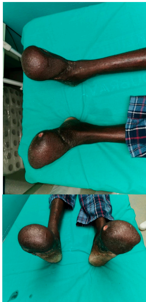
Figure 4. Patient's feet 3 weeks after the last operation.