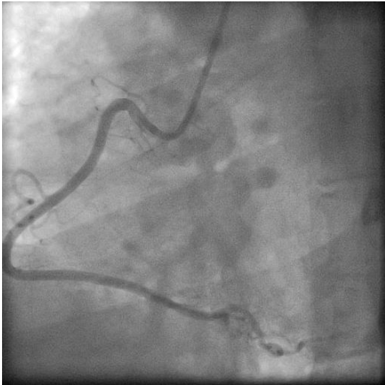
Figure 2.b Coronarogram of RCA