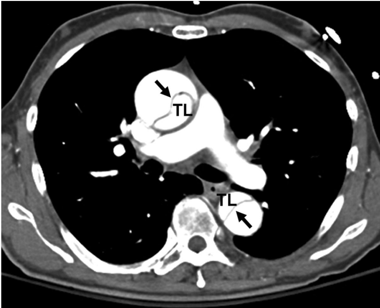
Figure 2. Contrast computed tomography scan demonstrating acute type A aortic dissection with enlargement of the ascending aorta and intimal flap (arrow) in the ascending and descending aorta. Both the true lumen (TL) and false lumen are opacified with contrast in this example.