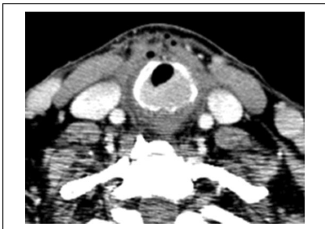
Figure 2. Computed tomography (CT) scan showed a cricoid cartilage mass 2.4 \times 1.6 cm with destruction of cartilage, causing significant airway stenosis.