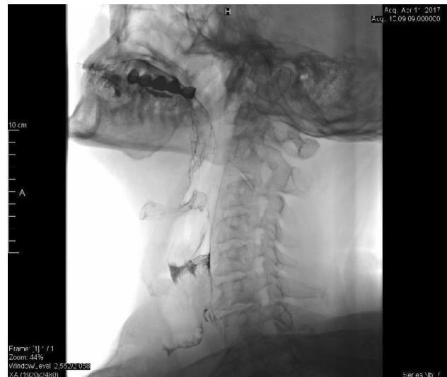
Fig. 1 The fistula in the lower third of the neck; Barium X-ray Swallow

Our plan was to re-operate the patient with the aim of exploring the neck and hypopharynx and closing the fistula. Combined external and endoscopic approaches were planned. We accessed the hypopharynx through the