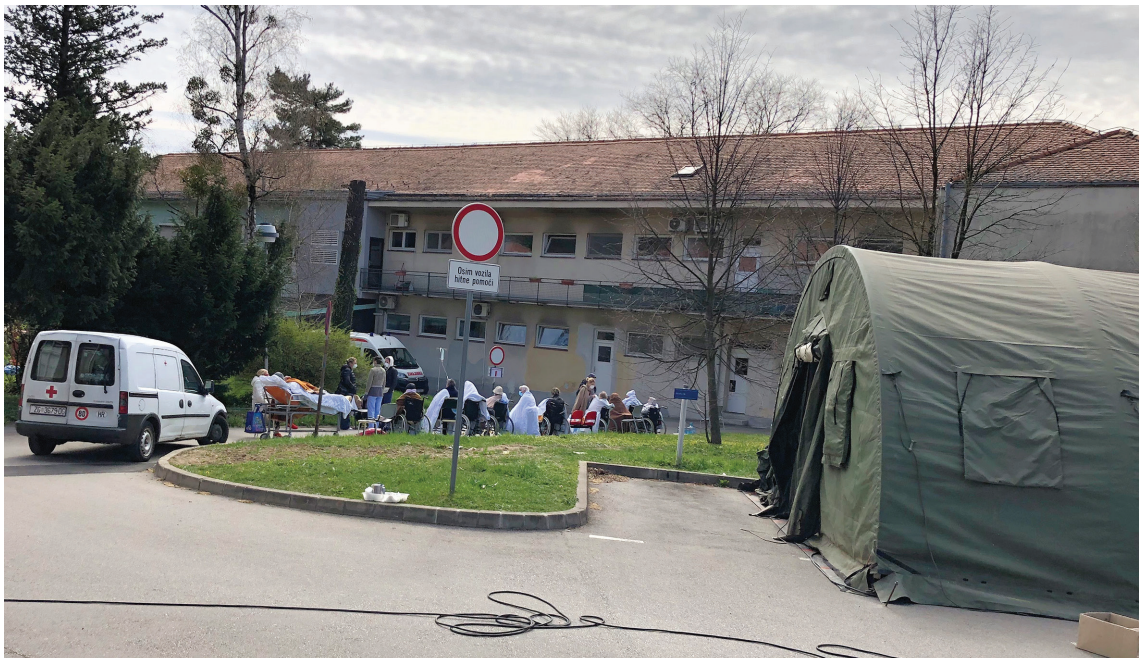
Photo: During the earthquake in Zagreb on 22 March 2020, 86 patients, including 22 COVID-19 patients, were evacuated from the extensively damaged hospital buildings.

In addition to property damage, we were quite apprehensive that the earthquake would accelerate the spread of the COVID-19 epidemic in Croatia since the earthquake, which left many homeless and fearful of earthquakes to come, triggered migrations to other parts of the country. However, six weeks since the first COVID-19 case and three weeks after the earthquake, only 1650 cases have been registered in