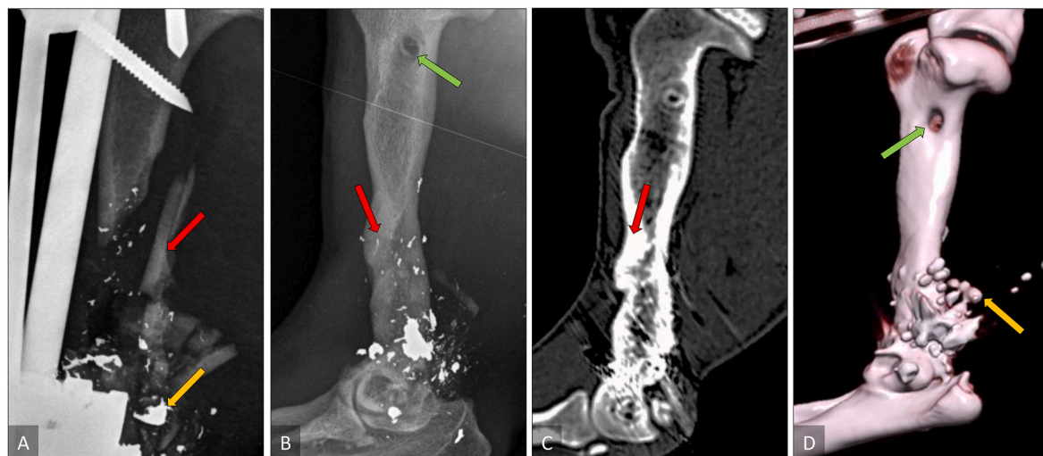
Fig. 3. (A) The X-ray image after the initial surgery using external fixator for the leg immobilization. The red arrow indicates a bone fragment, while the yellow arrow indicates gunshot pellet residuals. (B) X-ray image taken on the last clinical examination; red arrow indicates a bone fragment which was successfully integrated into the regenerated bone continuum, while green arrow indicates holes of removed external fixator pins. (C) CT section and (D) 3D reconstruction taken on the last visit confirming humeral segmental defect restoration.

around the distal humerus (Figs. 2A and 3A). The elbow range of motion was 30–40% preserved without full flexion and extension. The X-ray controls were performed monthly for the next three months (Fig. 2A). However, a complete lack of the defect rebridgment and absence of bone