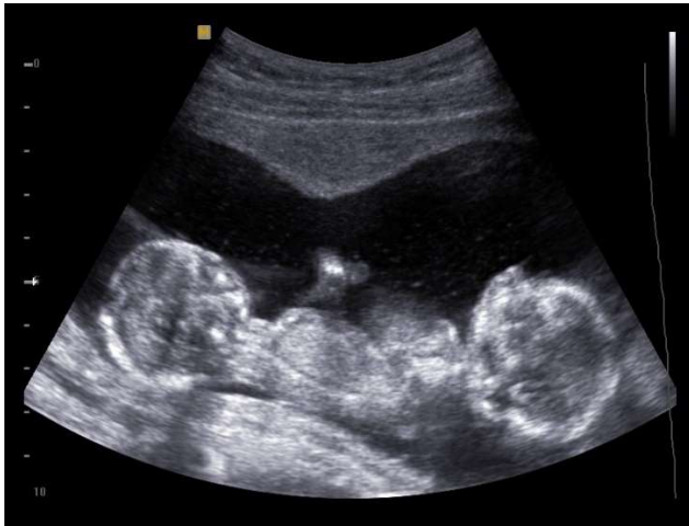
Figure 2 Monochorionic monoamniotic twin pregnancy, second trimester ultrasound image.

Furthermore, the pathologic examination is also specific for each type of twin pregnancy. DCDA pregnancy is determined by observing two separate placentas and a four layered intertwin membrane. When it presents with a fused placenta, the distinction can be made by observing the intertwin membrane. MCDA presents with fusion of two placentas into one and a two layered intertwin membrane. Lastly, MCMA presents with absence of an intertwin membrane (Figure 2). (1) It is important to note that MC type specific complications, mentioned later, typically arise from the anatomic characteristics of the placenta, such as peripheral cord insertion, uneven placental sharing and the presence or absence of different types of intertwin vascular anastomoses. (2,10)