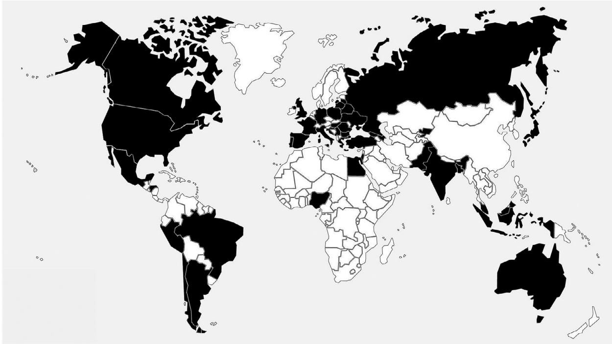
Fig. 1 Map of the 40 participating countries.