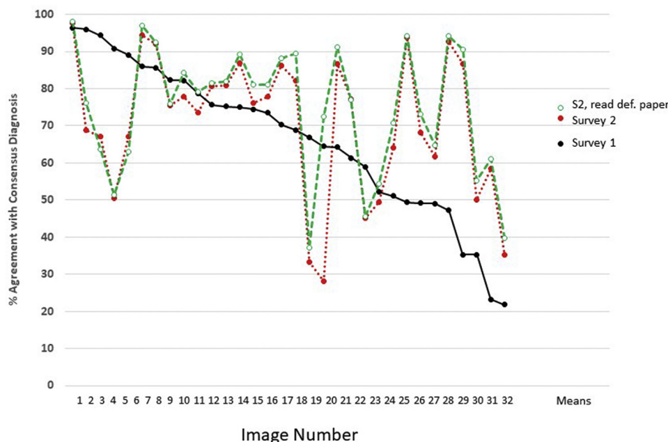
Figure 1. Comparison of findings of S1 versus S2. The horizontal axis lists the 32 lesions and structures depicted in the surveys in descending order based on the percent agreement with the consensus diagnosis in S1. The lines represent the percent of all respondents ( n = 297 for S1, n = 181 for S2, and n = 111 for S2 respondents who read the def. paper) agreeing with the consensus answer for each of the 32 images, with the means of the 32 values represented by the points at the far right. P values, determined by paired t tests, were 0.097 for S1 versus S2 and 0.026 for S1 versus S2 respondents who read the def. paper. def. paper, definitions paper; S1, survey 1; S2, survey 2.

respondents who read this paper that took S1 was greater than that of respondents not reading the paper, and percent agreement with the consensus answers in S2 was also significantly better among respondents who completed S1 than in those who did not ( P < 0.001 by paired t test, means 73.9\% \pm 16.8\% and 68.9\% \pm 18.7\% , respectively). We therefore evaluated the impact of whether or not respondents read the def. paper separately in those respondents who did and did not complete S1. By paired analysis, percent agreement with consensus answers in S2 was significantly greater in respondents who read the def. paper, whether they did ( P < 0.0001 by paired t test, means 76.3\% \pm 16.2\% and 68.6\% \pm 19.3\% , respectively) or did not ( P < 0.0001 by paired t test, means 72.5\% \pm 20.7\% and 64.8\% \pm 19.6\% , respectively) complete S1 (Figure 2b and c).