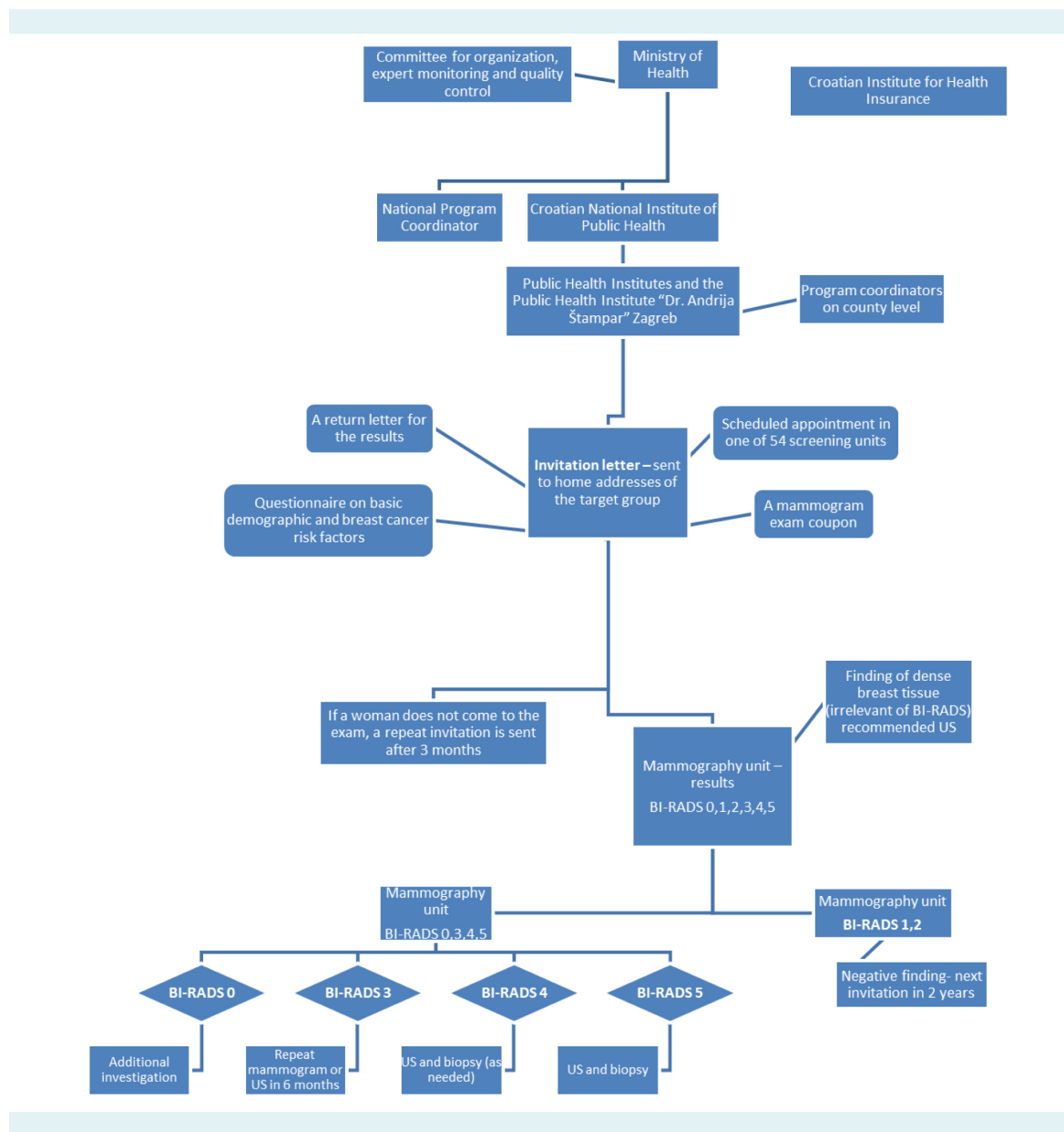
FIGURE 1. Workflow of the Croatian National Breast Screening Program. BI-RADS – Breast Imaging Reporting and Data System; US –ultrasound.

In Croatia, breast cancer is the leading cancer in women, and the average annual number of diagnosed cases in the 2014-2018 period was 2810. According to the latest data from the Croatian National Cancer Registry, there were 2845 new breast cancer cases (crude incidence rate of 134.7/100,000) in 2018, accounting for 24% of all new cancer cases in women (3). In 2020, 722 women died due to breast cancer (crude mortality rate of 34.7/100,000) (4). According to the Euro-