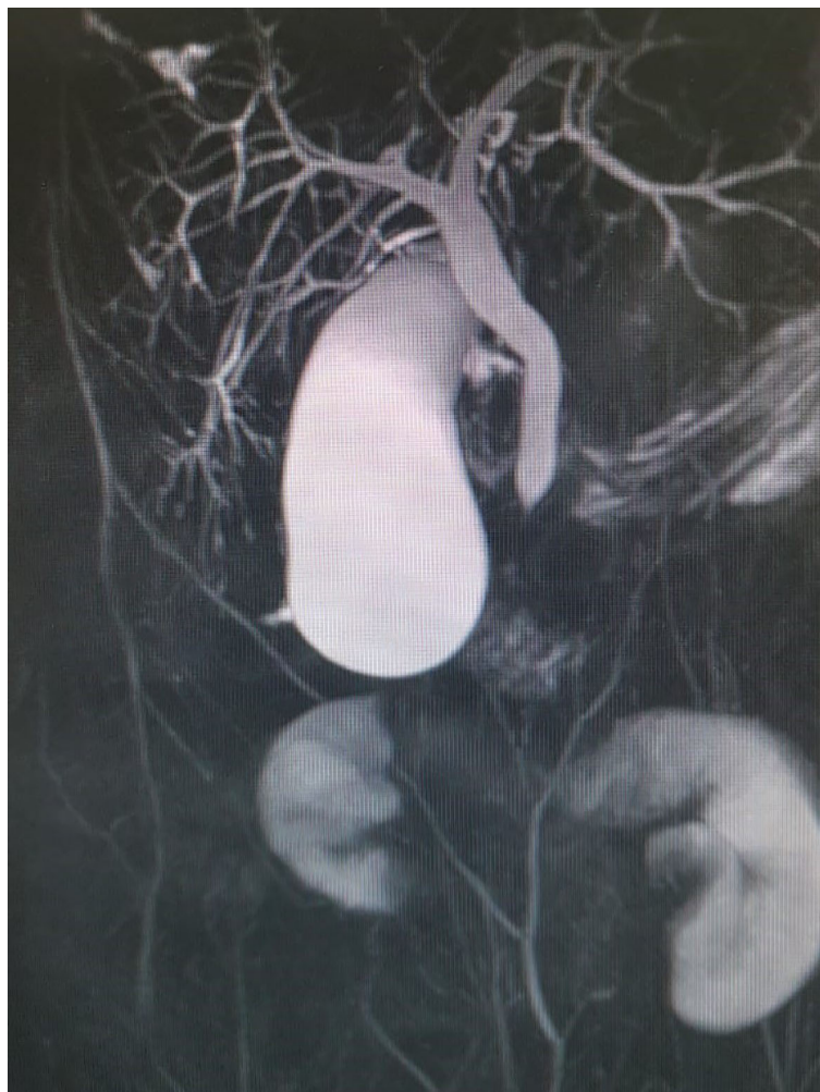
FIGURE 3 | Distended common bile duct and intrahepatic bile ducts on magnetic resonance cholangiopancreatography (MRCP).

patients in the literature shows that none of the reported adult or juvenile hypomyopathic DM patients, despite of laboratory (abnormal CK), electrophysiological (abnormal EMG) and/or radiologic (MRI) evidence of myositis, developed clinically significant myositis during a mean follow-up exceeding 5 years (15–18). Therefore, the presence of subclinical myositis is not predictive of a future clinically significant myositis.