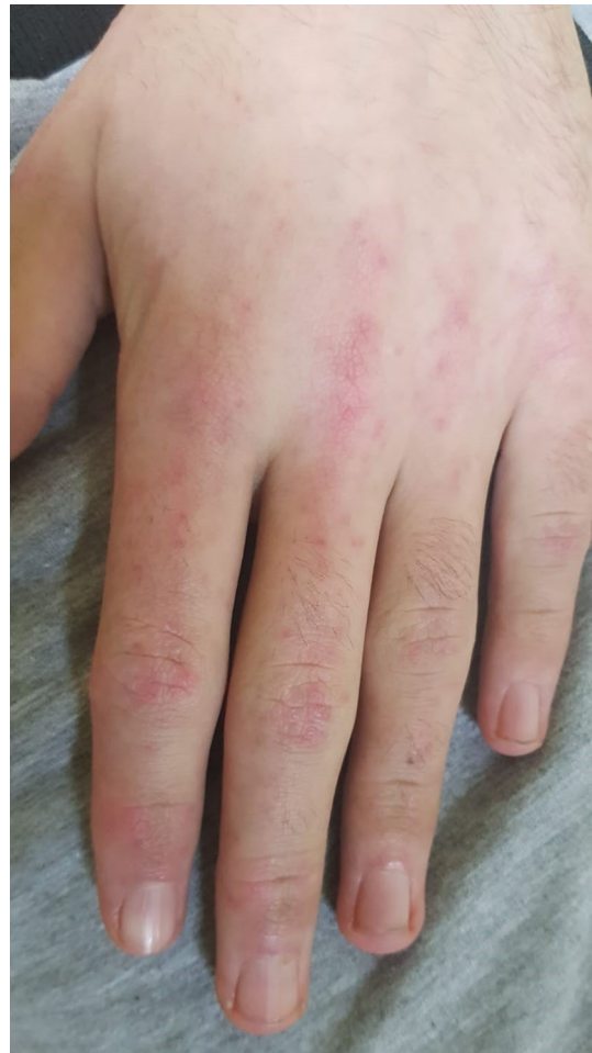
FIGURE 1 | Characteristic cutaneous features of DM called Gottron's papules (multiple erythematous papules over the dorsal aspect of metacarpophalangeal and interphalangeal joints).

fever, myalgia or weight loss. Physical examination revealed characteristic cutaneous features of DM including Gottron's papules (multiple erythematous papules over the dorsal aspect of metacarpophalangeal and interphalangeal joints, Figure 1 ), Gottron's sign (violaceous macules over extensor surfaces of elbows and medial malleoli), heliotrope rash (violaceous erythema of the eyelids or periorbital skin) and the malar rash, including the nose bridge ( Figure 2 ). The rest of the physical