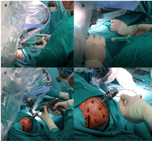
Figure 3. Frameless stereotactic brain biopsy and external ventricular drainage placement using the RONNA G4 system. (A) Using RONNA, skin perforation and twist drilling with a 4.5-mm drill and electrocoagulation of dura is done, as described in Dłaka et al. 2021. for frameless stereotactic brain biopsy, (B) obtaining tumor tissue for pathohistological analysis [7, 8]. Afterwards, the robot changed position to obtain proper position for EVD placement. (C) After skin perforation, twist drilling, and electrocoagulation, (D) an EVD catheter was placed in right lateral ventricle and clear cerebrospinal fluid was obtained under elevated pressure.

on first pass, a catheter placement using number of robot-assisted systems was done [1, 2, 4–6, 11]. Moreover, some authors design a prototype of the robotic navigation system to allow surgeons who do not have explicit neurosurgical training to place EVDs [9].