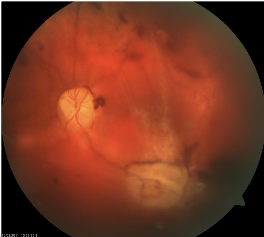
FIGURE 1 : FUNDUS PHOTOGRAPHY OF PROLIFERATIVE DIABETIC RETINOPATHY

As DR progresses, retinal ischemia will lead to intra-retinal and intra-vitreous neovascularisation, characteristic of PDR. These new vessels can be the cause of vitreous haemorrhage, that, if repeated, can lead to tractional retinal detachment and vision loss (21). PDR is associated with an increased occurrence of DME and fibroproliferative events, such as retinal traction, retinal detachment and vitreous hemorrhage (20).