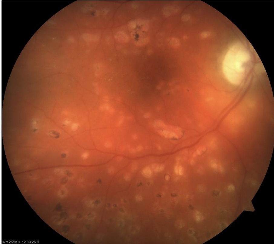
FIGURE 6 : FUNDUS PHOTOGRAPHY OF PROLIFERATIVE DIABETIC RETINOPATHY AND MACULAR EDEMA AFTER LASER PHOTOCOAGULATION

However, conventional laser treatment being a destructive treatment, it can lead to undesirable side effects affecting vision, such as permanent scotomas in the visual fields, worsening of night vision and delay in light-to-dark adaptation (29). Other side effects include permanent retinal scarring, choroidal detachments, elevated intraocular pressure, cystoid macular edema and decreased patient peripheral vision and color vision (36).