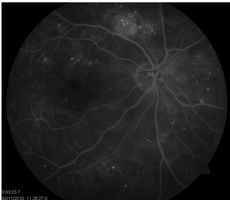
FIGURE 3 : FLUORESCEIN ANGIOGRAPHY OF DIABETIC MACULAR EDEMA AND NONPROLIFERATIVE DIABETIC RETINOPATHY

Fluorescein angiography (FA) is an invasive medical imaging technique. It provides images of the fundus of the eye after injecting a fluorescent dye (fluorescein) into a vein. It is a dynamic test with a larger field of view (26). FA is helpful for visualizing retinal ischemia, as well as leakage from retinal neovascularization and also in macular edema (25).