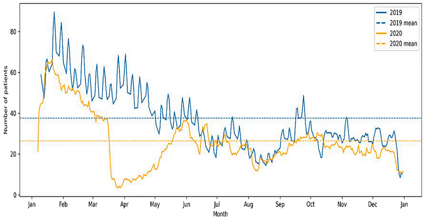
Fig. 3. The number of patients utilizing outpatient services during 2019 and 2020.

Trends in the number of emergency evaluations at the University Psychiatric Hospital Vrapce during 2019 (blue line) and 2020 (yellow line), while the dotted line represents the mean for the corresponding year.