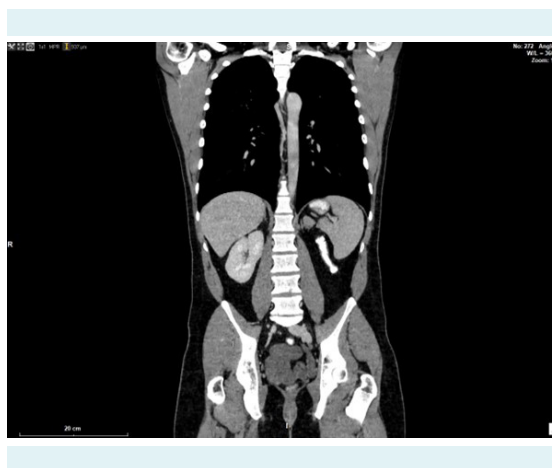
FIGURE 2. Multi-slice computed tomography with gastrografen showing renal agenesis and a multicystically dilated seminal vesicle.

A left-sided inguinal orchiectomy was performed. The spermatic cord, epididymis, and testis were sent to pathology. Gross inspection revealed a 3.5 cm-diameter cystic cavity with brown fluid content and the surrounding brownish parenchyma. Histologic examination showed a cystically dilated rete testis lined with cuboidal epithelium, positive for cytokeratins. Microscopically, the cystic cavity contained extravasated erythrocytes and large clusters of siderophages. The ducts of the epididymis were cystically dilated and had siderophages inside their lumina. Seminiferous tubules of the testicular parenchyma were also surrounded by siderophages (Figure 1 A, B). The diagnosis of cystic dysplasia of the rete testis was based on clinical information, histological examination, and immunohistochemical analysis. The relationship between ipsilateral genitourinary abnormalities and cystic dysplasia of the rete testis is well-known. Therefore, the patient underwent a multi-slice computed tomography scan, which revealed ipsilateral renal agenesis, a right seminal vesicle cyst reaching up to the iliac arteries, and a multicystic formation cranial to the prostate (Figure 2). The patient fully recovered after surgery and was doing well during follow-up. The timeline of diagnostic tests and interventions is shown in Table 1.