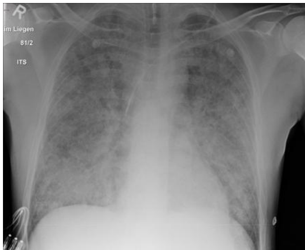
Figure 3. Chest X-ray in GS patient demonstrating diffuse infiltrative opacification consistent with diffuse alveolar hemorrhage.