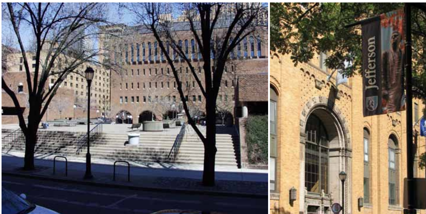
Figure 2ab. Thomas Jefferson University, Philadelphia. I started as a postdoc in 1990 and later completed my residency training in pathology in 1996.