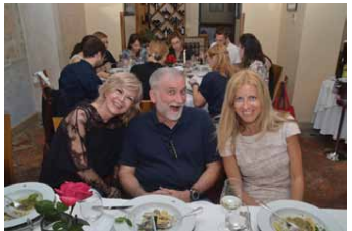
Figure 6. Several images from a couple of Ljudevit Jurak symposia (collage). It is always nice to meet old, and make new friends.