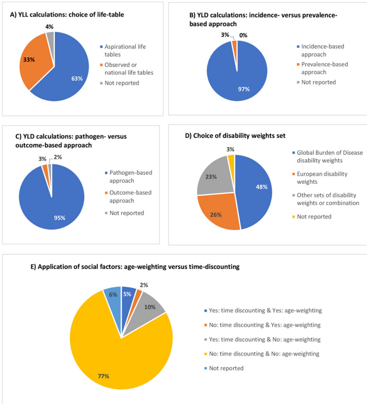
Fig. 3. Methodological approaches used to estimate YLL and YLD in independent burden of infectious disease studies, 2000–2022*. *Proportions for burden of infectious disease studies that included years of life lost calculations were reported for 102 out of 105 studies, while for those included years lived with disability were reported for 95 out of 105 studies.

estimation or over-estimation of the burden of a certain infectious disease. Each methodological choice has an impact on the resulting DALY estimation and by choosing a uniform methodology (e.g. disability weights, life expectancy) or epidemiological model (e.g. disease model, severity level distribution), these choices may not reflect the disease agent or study population, and as a result the DALY estimates will not reflect the true burden of disease.