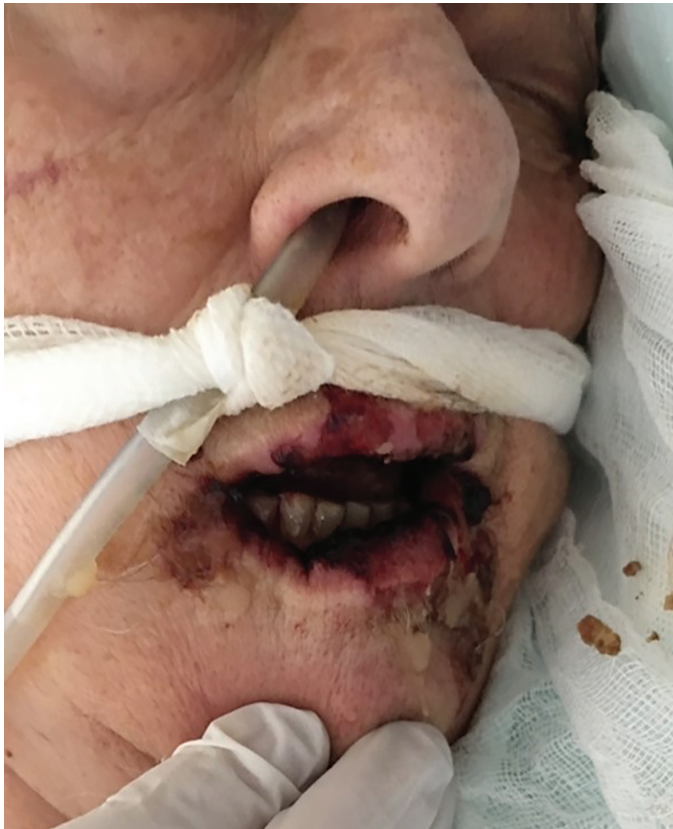
Figure 3 | Erosive mucositis in a patient with paraneoplastic pemphigus associated with bladder cancer.

for PNP is poor, with a 5-year survival rate of 38%, because of infections and evolution of neoplasia (4).