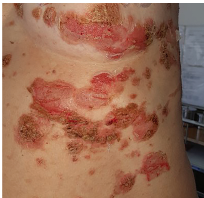
Figure 1 | Multiple erosions on the trunk of a patient with pemphigus vulgaris.

Pemphigus herpetiformis is a term that describes PV or PF that manifests with urticarial plaques and cutaneous vesicles arranged in a herpetiform or annular pattern. Pruritus is frequently present. Mucosal involvement is uncommon (21).