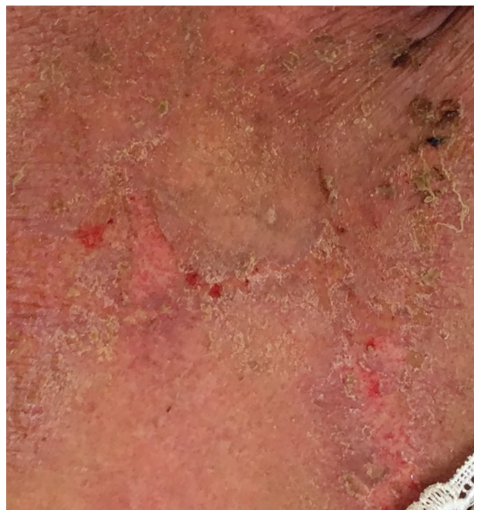
Figure 2 | Pemphigus foliaceus is characterized by erythema, scaling, and crusting, preferentially in seborrheic areas.

Another clinical variant of PF is pemphigus erythematosus (Senear–Usher syndrome). Clinical features resemble cutaneous lupus erythematosus with superficial erosions, erythema, and hyperkeratosis. In about 80% of cases, antinuclear antibodies in the medium titer range can be detected, usually in a homogeneous pattern without anti-ds-DNA antibodies (9).