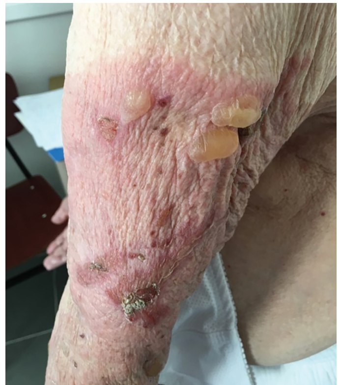
Figure 4 | Arm skin with tense bullae arising on urticarial plaques in a patient with bullous pemphigoid.