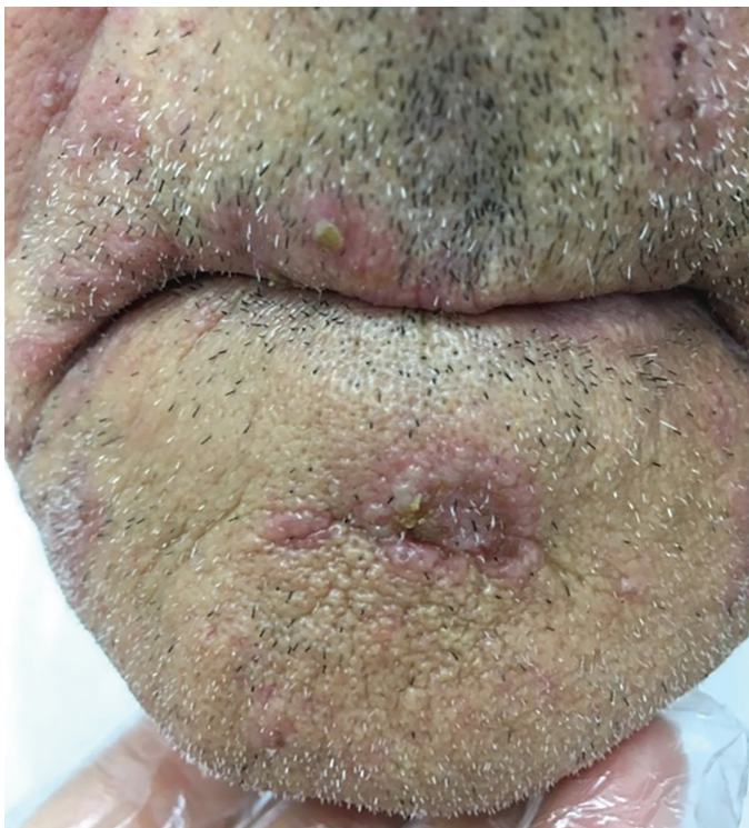
Figure 7 | Tense bullae, erosions, and crusts on the face of a patient with epidermolysis bullosa acquisita.