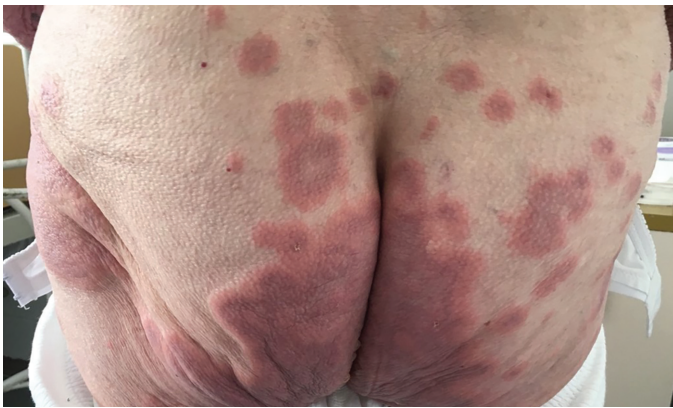
Figure 5 | Erythematous, urticarial plaques on the posterior trunk and gluteal region in a patient with a nonbullous form of bullous pemphigoid.