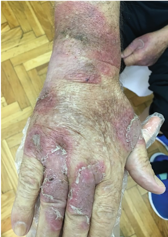
Figure 6 | Skin fragility, blisters, crusts, and erosions in areas that are more subject to pressure and trauma, such as extensor surfaces of the extremities in this patient with a mechanobullous form of epidermolysis bullosa acquisita.