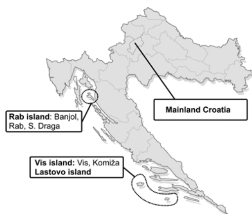
Figure 1. Geographic location of the studied population samples (Croatian general population, "Rab cluster," and "Vis cluster").

Eventually, we compared a sample of 6000 examinees representative of the population of Croatia, a sample of 300 examinees from Rab island (villages Rab, Banjol, and Supetarska Draga), and a sample of 300 examinees from two neighboring islands of Vis and Lastovo (villages Vis, Komiža, and Lastovo) (Figure 1). The justi-