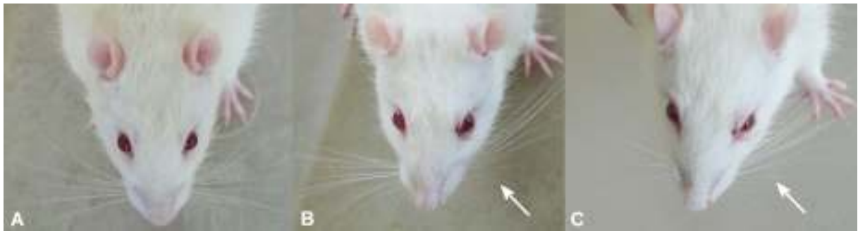
Figure 1 Whisker appearance 1 day after administration of A) physiological saline, B) BTX-A first injection, C) BTX-A second injection. Saline and BTX-A were administered to the left whisker pad.