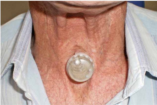
Fig. 1. Voice prosthesis with automatic valve.

geal function, tracheoesophageal puncture with the insertion of various voice prostheses being the most often used. The choice of speech rehabilitation varies from patient to patient, but tracheoesophageal (TE) voice has become the preferred method. Singer and Blom introduced the tracheoesophageal puncture and voice prosthesis in 1979 3 . Since then, general principles remain the same, though numerous variations on the procedure and of the prosthesis itself have been performed 2 . TE fistula formation allows air, initially coming from lungs, to flow through the trachea into the esophagus, while the valve in the prosthesis at the same time prevents entering of food and liquid backwards into the trachea (Figure 1.). The voice is then formed in the vibratory segment of the