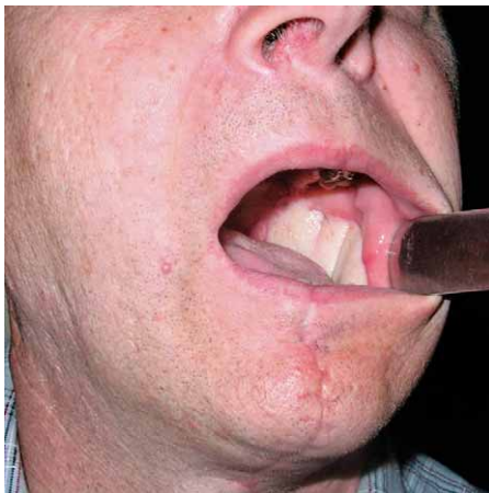
Fig. 4. Final outcome.