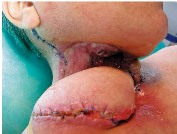
Fig. 7. Partial flap necrosis.

ivary fistula, which occurred as a postoperative complication following surgical treatment of advanced laryngeal carcinoma. The patient had no risk factors other than heavy smoking. He had successful second salvage procedure with fasciocutaneous forearm flap in combination with contralateral PMMPF. Partial flap necrosis occurred in 3 patients (11.1%) and all of them had records of previous treatment, one with surgery alone, and other two with surgery and radiation therapy. The incidence of salivary fistula occurred in 5 patients, and interestingly 4 out of 5 patients had hypopharyngeal reconstruction. PMMPF attained favorably successful result in 96.3% of cases.