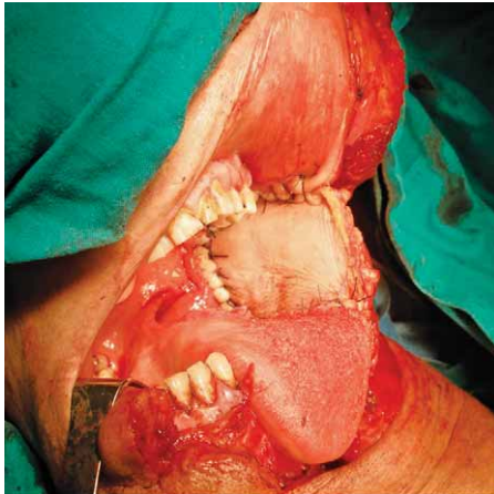
Fig. 3. Flap insertion.

between the neck and chest. The flap was passed through the tunnel and properly placed into the defect (Figure 3, 4). The donor site was closed primarily or with skin graft in case of skin shortage. Variation to the described technique would include flap without overlying skin island in the form of myofascial flap 29 . If the patient is female, better aesthetical outcome is achieved by placing the inferior skin incision line into the submammary fold.