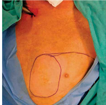
Fig. 1. Skin island markings.

After ablative procedure, the xiphoid and acromion were identified and properly marked. The size of the skin island was calculated by direct intraoperative measurement of the defect size. Skin island was then properly marked at the inferior medial border of the pectoralis major muscle (Figure 1). The initial incision was performed along previous markings in the oblique fashion down to the pectoral fascia in order to include more musculocutaneous perforators. Afterwards, the skin island