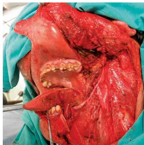
Fig. 2. Postresection defect.

was sutured to the muscle with interrupted absorbable sutures to secure the perforators during the operative handling. In order to preserve other possible regional flaps, like deltopectoral Backamijan's flap 25 , low skin incision was performed from the lateral border of the island to the anterior axillary fold 26 . Finding the lateral border of the pectoralis major muscle was facilitated by a blunt dissection from inferiorly to superiorly. Vascular pedicle was identified on the deep surface of the pectoralis major muscle by palpation and visualization after the flap has been completely dissected of the pectoralis minor muscle. Major vascular contribution comes from the pectoral branch of the thoracoacromial artery, and minor from lateral thoracic artery 27 . Special attention was required during dissection of sternal border and abdominal border of the muscle. Perforators from internal mammary artery should be preserved because they feed deltopectoral flap above the 4 th rib and give cutaneous vessels for the flap between 4 th and 6 th rib. If one should extend the flap below the 7 th rib, partial flap necrosis is in jeopardy, because the cutaneous perforators derive from superior epigastric artery 28 . After completing the dissection (Figure 2), a subcutaneous tunnel was formed