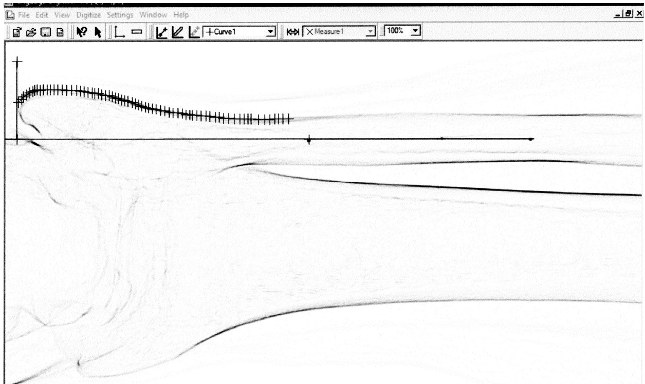
Figure 1. Digitization of one fibula