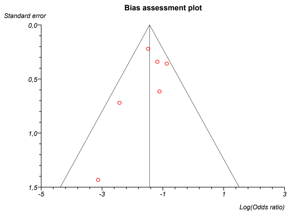
FIGURE 1 Bias assessment plot.