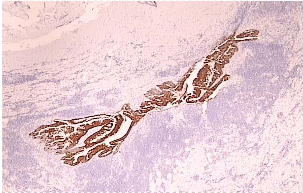
Figure 4. Pathohistological diagnosis of removed appendix revealed adenocarcinoma of the appendix immunohistochemically positive for CK20+.