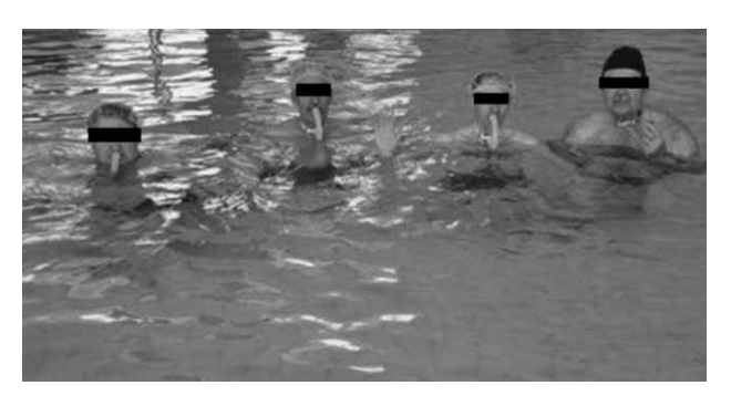
Fig. 1. Members of the Laryngectomy Swimming Club in a pool.

At the end of three months, the patients were divided into two groups: the swimmers (n = 17) and the nonswimmers (n = 83). The swimmers were members of the Laryngectomy Swimming Club and in average swam 3 hours a week. Normal swimming is possible after total laryngectomy in a well-motivated and previously experienced swimmer with simple equipment. These swimming aids consist essentially of an extension tube plugged firmly and securely into the tracheal stoma, forming a water-tight seal while the other end of the tube is flattened and put between the lips (Figures 1 and 2). During inspiration, the airflow goes through the nose, into the mouth, and through the tube in the trachea and the lungs. The laryngectomee should never swim alone, and it is strongly advised that attending swimmers or family should be trained in the rescue and resuscitation of a laryngectomee<sup>1,9</sup>