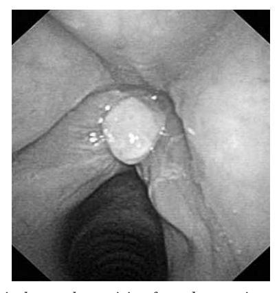
Fig.\ 1.\ Typical\ granuloma\ rising\ from\ the\ anterior\ commissure.

Granuloma. Granulomas (Figure 1) are non-cancerous growths composed mostly of granulation tissue and they reflect tissue response to injury and irritation. They frequently occur at 1–2 months after surgery, and it is not rare that they later disappear. It is important not to overlook the difference between granuloma and cancer recurrence. When endoscopic finding definitely indicates granuloma, no further treatment is necessary. However, if endoscopic finding is raising any suspicion, control laryngomicroscopy with biopsy and histologic analysis is necessary.