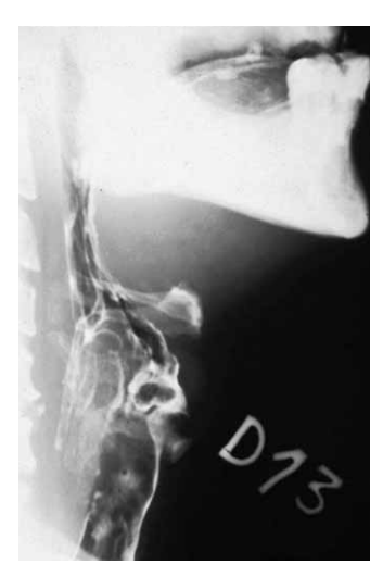
Fig. 3. Videfluoroscopy during barium swallow showing aspiration in a patient with endoscopic supraglottic laryngectomy of T2

hemorrhage was documented in 13 (6.4 %) patients. In seven of these, it was necessary to perform a revision in the operating room, while one patient with supraglottic cancer died on postoperative day 9 due to massive late bleeding. Temporary aspiration occurred in 19 (26 %) patients with supraglottic cancer resection (Figure 3), six of them developing postoperative pneumonia. One patient suffered heavy aspiration and recurrent aspiration pneumonia, thus total laryngectomy was performed nine months after primary ELS. In patients treated for glottic carcinoma, close follow-up revealed granulomas in ten and synechiae in seven patients. Seven patients had more than one complication.