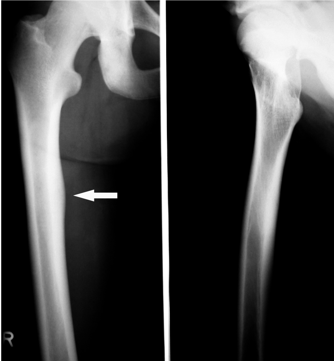
Figure 1. AP and LL roentgenograms demonstrating stress fractures in the proximal third of the femoral shaft (white arrow).