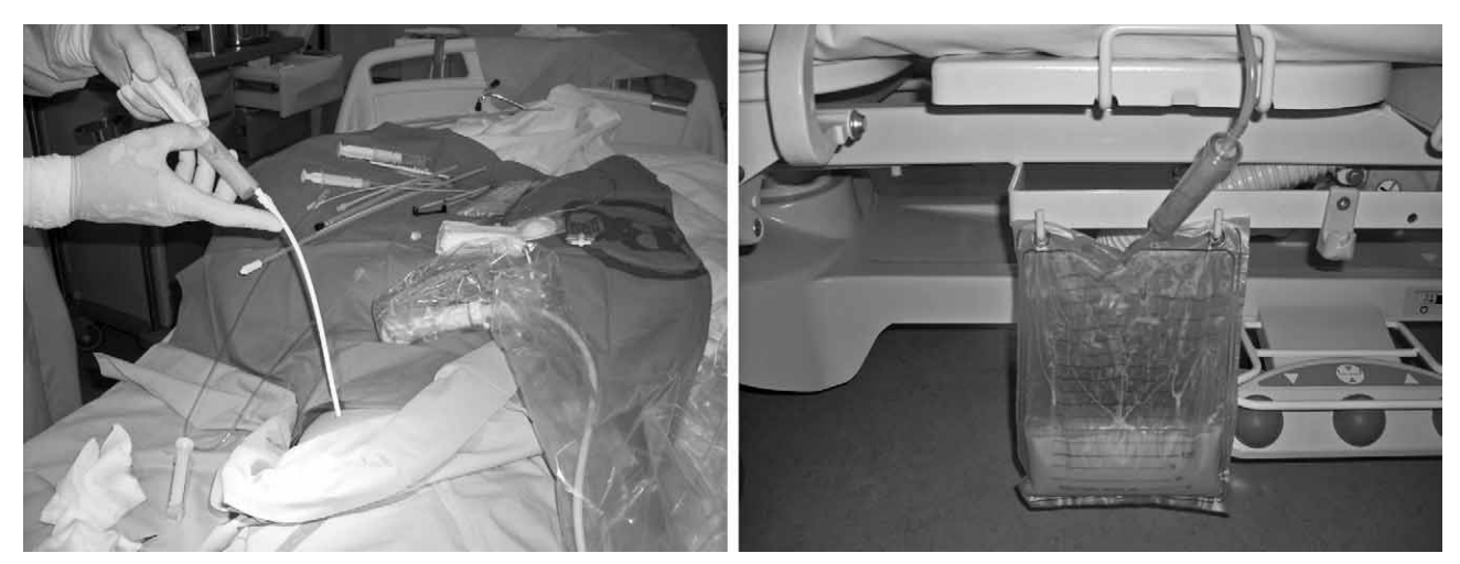
Fig. 3. Percutaneus drainage of peripancreatic collection.

Various possibilities of better management of severe acute pancreatitis are being investigated, among others place and role of prophylactic antibiotic therapy in chemical necrosis, place and role of parenteral in relation to enteral nutrition, etc. Two studies showed better survival of patients who received antibiotic prophylaxis (imipenem, ciprofloxacin, ceftazidine) compared to those on placebo<sup>9,10</sup>. However, these results were later not confirmed. Prophylactic antibiotic therapy is today, even in severe acute pancreatitis, not recommended. Other side it is absolute need for antibiotic therapy in the case of documented and confirmed infection by fine needle biopsies. Very common this strategy is more from theoretical significance and in the case of suspected infection after few days antibiotic therapy is indicated. The choice of antibiotic therapy is of course important. In the case, that there is not antimicrobial specimen, antibiotic penetrating in pancreas parenchyma like imipenem, meropenem, ceftazidim are important. Enteral nutrition at the level of jejunum in severe pancreatitis did not show worse results than parenteral nutrition. Enteral nutrition with nasojejunal tube is important to prevent bacterial translocation from the gut and to restore integrity of enteral