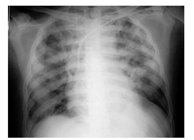
Fig. 1. ARDS in patient with severe pancreatitis on artificial ventilation.

Respiratory failure is very serious complication of severe acute pancreatitis. In Figure 1 is presented ARDS as a complication of this disease, in Figure 2 X ray of lungs after improvement with artificial ventilation in the some patient. Development of pancreatic collection is one additional possible complication of severe pancreatitis. Figure 3 demonstrate peripancreatic drainage as useful procedure to eliminate inflammatory collection.