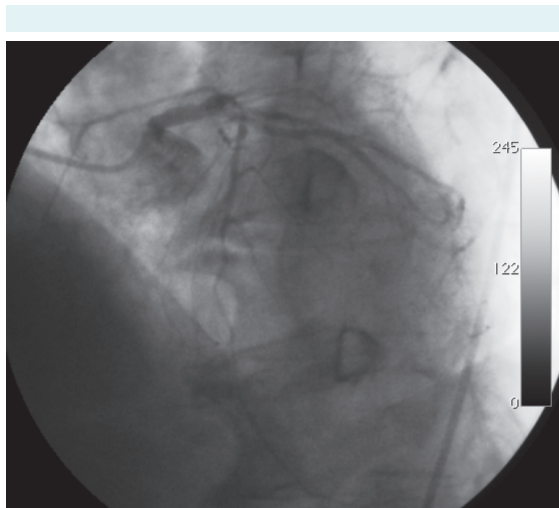
FIGURE 1. Diffuse stenosis of the left anterior descending artery and distal pruning of left circumflex artery in a patient 6 years after heart transplantation.

(4). Unnoticed by coronary angiography, the most of the intimal thickening occurs during the first post-transplant year (5). The disease progression is often complicated by intracoronary thrombosis and subsequent, often silent, acute myocardial infarction (Figure 2) (6). Early mural thrombi primarily contain platelets, while succeeding thrombi are more organized, usually occlusive and primarily consist of fibrin (7). Development and progression of CAV in transplant patients is strongly associated with enhanced platelet activation, although no evidence supports the benefit from aspirin therapy in these patients (8,9).