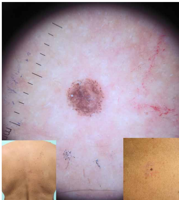
Fig. 1. Dermoscopic image: combination of globular, reticular and nonspecific global structure, asymmetry of the structure with irregular globules at periphery, atypical network and blotch centrally; inserted clinical images of a brown pigmented lesion of 4mm on the upper back of the 44-year-old man with negative family history for melanoma and syndrome nevi dysplastici, and without history of change of nevi; clinical examination revealed more than 50 nevi with mainly reticular global structure; pathohistology diagnosis is Superficial atypical melanocytic proliferations of uncertain significance.

Over the last two decades sensitive diagnostic techniques have been developing in order to improve detection of both early and featureless melanomas 12 .