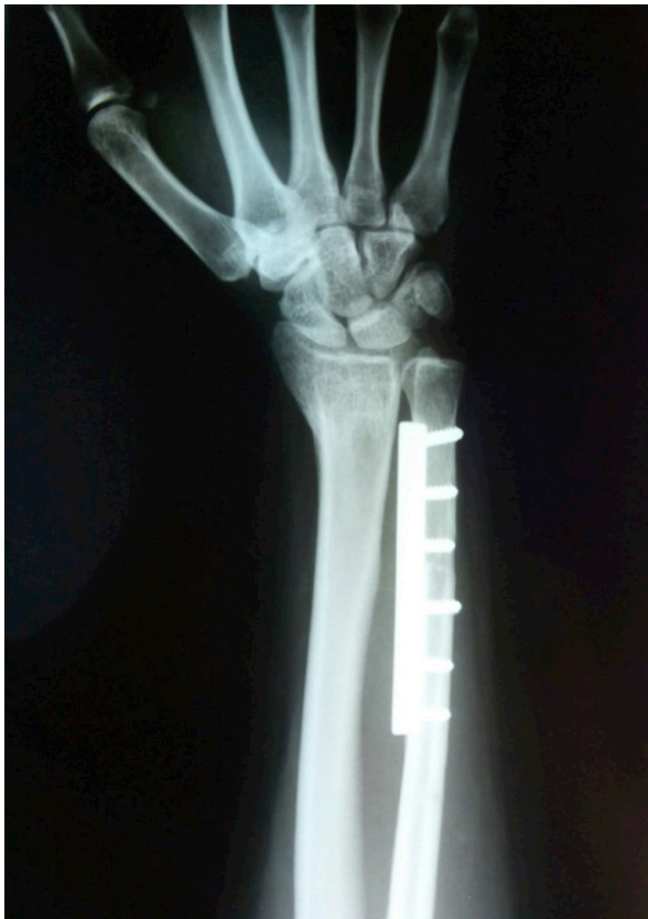
Fig. (2). Radiogram showing postoperative neutral radio-ulnar variance achieved.

Although corrective osteotomy of the distal part of the radius restores anatomical relations between distal radius and ulna it may often be technically difficult procedure [4, 5]. On the other hand, in some cases with minimal radial angulation that kind of procedure is even unnecessary. That is why ulnar shortening osteotomy (USO) has become the standard for correcting positive ulnar variance [6, 7]. Goal of the shortening procedure is to relieve the symptoms by re-establishing a neutral radio-ulnar variance (Fig. 2). Many authors described different options for this procedure in order to achieve the best possible functional results. In this paper we present a variety of surgical techniques available for USO, their advantages and drawbacks.