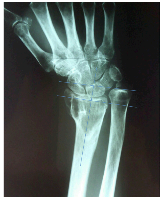
Fig. (1). Radio-ulnar variance measurement.

Distal radius fracture is one of the most common fractures accounting for around 25% of fractures in the pediatric population and up to 18% of all fractures in the elderly age [1]. Malunion of distal radius fracture often results in radial shortening as the main deformity, with disturbed radio-ulnar variance, quite often associated with lesions of triangular fibrocartilage complex (TFCC) and instability of the distal radioulnar joint (DRUJ). Radio-ulnar variance is defined as the difference in length between the distal ulnar corner of the radius and the most distal aspect of the dome of the ulnar head. Positive ulnar variance means that the dome of the distal ulna is more distal than the ulnar corner of the distal radius [2] (Fig. 1). This positive variance may lead to ulnar sided wrist pain, limited ulnar deviation and forearm rotation with development of degenerative changes due to the overloading that occurs between the ulnar head and the ulnar carpus. Impaction of the ulnar head