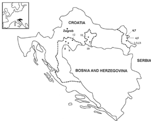
Figure 1. Geographical locations of the 13 analyzed wells: 1. Borovo-Lovački Dom, 2. Borovo Selo, 3. Čakovci, 4. Dalj-Planina, 5. Daljski Atar, 6. Erdut-Dunavska Ulica, 7. Erdut-Žarkovac, 8. Gredjani, 9. Gvozd, 10. Okučani, 11. Pakrac, 12. Petrinja, 13. Vukovar-Ulica Nova. Dotted lines show the parts of Croatia temporarily occupied from 1991 to 1995.

ed in the immediate vicinity of the Croatian-Serbian border. The sites Borovo-Lovački Dom, Borovo-Selo, Čakovci, Dalj-Planina, Daljski Atar, Erdut-Dunavska Ulica, Erdut-Žarkovac, and Vukovar-Ulica Nova were all within a 4 km radius of the border. These 8 sites also contained the majority (55/61 or 90.2%) of the recovered individuals. In contrast to this, most of the wells with one individual (4/6), and a single well with 2 individuals were located 150 or 200 km to the west, in other temporarily occupied parts of Croatia. The reasons for this discrepancy are at present unclear.