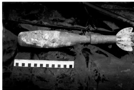
Figure 2. Unexploded tromblone shell recovered from the Vukovar-Ulica Nova well.

Three of the wells contained animal remains. The Borovo-Lovački Dom contained skeletonized and partially preserved remains of sever-