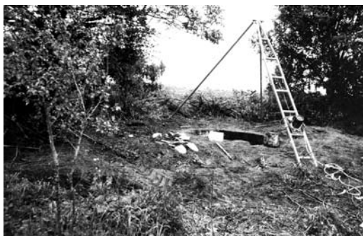
Figure 3. Simple pulley constructed above the entrance to the Čakovci well.

backhoes were used to remove the earth from one side of the well. When a sufficient depth was achieved, the wall of the well was perforated and recovery of the bodies was carried out. This procedure, however, was not only very costly and time consuming but increased the risk of collapse of the well walls. Furthermore, while this procedure could be attempted when wells were relatively shallow (the Petrinja and Okučani wells were approximately 8-9 m deep), it was clearly impractical in deeper wells. A different procedure was, therefore, used to recover human remains from these wells. In this procedure, a pulley was constructed above the entrance to the well and one of the professional well diggers was slowly lowered by a rope into the well (Figure 3). The material from the wells was placed into buckets and then pulled to the surface. All of the buckets were numbered and recovery proceeded according to layers.