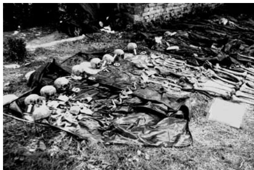
Figure 4. Recovery of human remains from the Vukovar-Ulica Nova well. All of the recovered individuals were skeletonized or partially skeletonized and extensively commingled. Arrows point to gunshot wounds.

Because the time between death and recovery of the bodies was between 4-14 years, some of the remains were completely skeletonized and commingled. As each body was recovered, it was assigned a location name and number. In cases of extensive commingling, all of the remains were removed together as a single layer, given a series of numbers based on a probable number of individuals present, and sent to the Department of Forensic Medicine in Zagreb for re-individualization (Figure 4). All attempts were made to