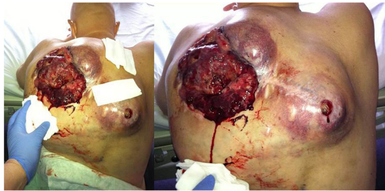
Fig. 1 Clinical picture of the exulcerated bleeding myofibrosarcoma of the posterior chest wall

molecular genetic alterations of the tumours are presently obscure, and they need to be reviewed in the future. Clinically, LGMS is an aggressive neoplasm with frequent recurrence rate and high metastatic potential and should be treated by surgically excision. The surgery should be performed by an experienced surgeon with preserving the function of blood vessels, muscles and nerves where possible. Evaluation of the resectability of a LGMS depends on the tumour stage and the patient's co-morbidity. The growth pattern of the cancer requires that a wide margin of normal tissues be removed with tumour debulking. This requirement, due to the anatomical considerations, must determine the type of operation. An acceptable margin of normal tissue is commonly