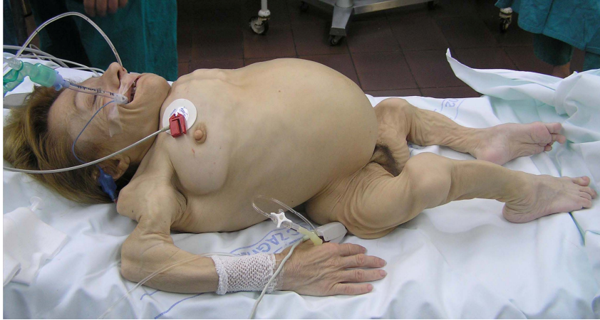
Fig. 1 Abdominal distension in a 44 years old woman with colon obstruction and osteogenesis imperfecta type III